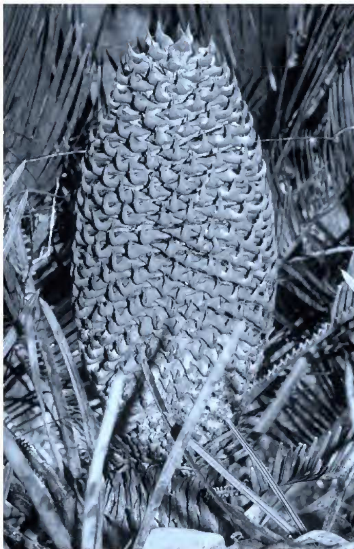
Fig. 5. Cycas cupida male plant with cone.

HILL, K.D. (1996). A taxonomic revision of the genus Cycas (Cycadaceae) in Australia. Telopea 7: 1–64.